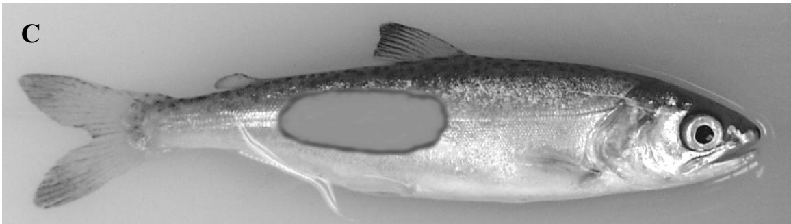
Figure 3. Descaling illustrations: A, no descaling; B, shaded area represents 3% descaling of one side; and C, shaded area represents 20% descaling of one side.