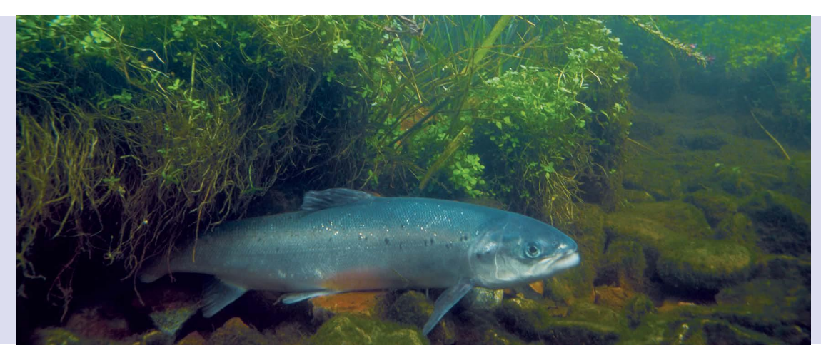
Atlantic Salmon

More than 90 percent of Maine's rivers and streams are impacted from the effects of dams. In fact, only approximately 8 percent of their historic spawning and rearing habitat in Maine is currently accessible. Over 400 dams exist along the rivers and streams that currently support wild Atlantic salmon in Maine and only 75 of these have fishways, a structure such as a fish ladder that allows fish to swim around barriers such as dams to reach their natural spawning grounds. Even at dams where fishways have been constructed, Atlantic salmon are often unable to find fishway entrances, leading to substantial delay and mortality during their migration. Salmon may also experience mortality from increased predation around dams. Dams also directly injure and kill migrating salmon (and other species); these problems are particularly acute at dams with hydroelectric turbines.