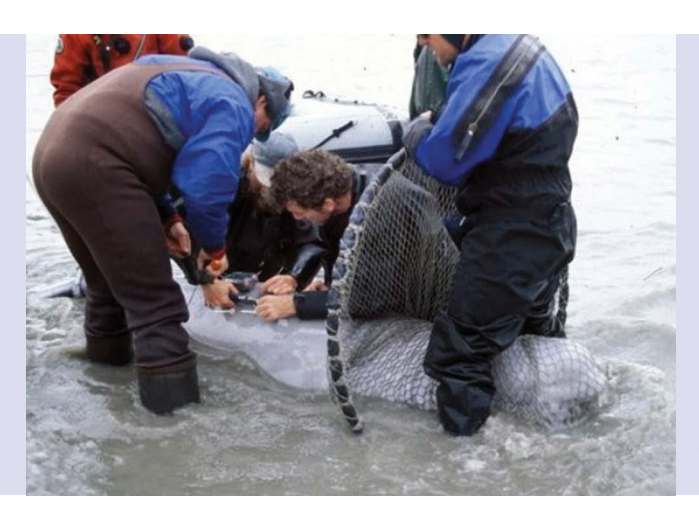
Beluga Whale

The belugas' summer core range is extremely silty due to the glaciers that feed into upper Cook Inlet. This makes their adept use of sound essential to communicate, locate prey, avoid predators, and navigate. Cook Inlet is a naturally noisy environment due to the extreme tides and heavy silt load. Adding human sounds from ship traffic, construction projects, oil and gas activities, and other sources can make it more difficult for belugas to thrive. Especially loud underwater sounds can kill marine mammals, but sublethal effects are more common, and include injury or behavioral changes that can range from mild (e.g., increased vocalizations) to severe (e.g., abandonment of vital habitat). Thus, assessing and managing the effects of human-caused noise is a major issue for the conservation and recovery of Cook Inlet beluga whales.