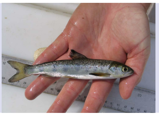
Atlantic Salmon Smolt

In the United States, commercial fisheries for Atlantic salmon have been closed since 1947; however, small but significant fisheries continue within the species' migratory corridor off the coast of Canada and Greenland. To effectively engage in issues requiring international collaboration such as these distant water fisheries, NMFS staff maintains a strong and influential presence at the North Atlantic Conservation Organization (NASCO) and International Conference for the Exploration of the Seas (ICES). NMFS' role is to work to reduce impacts to U.S. stocks from distant water fisheries, and seek to hold ourselves and other countries accountable for the protection and conservation of Atlantic salmon.