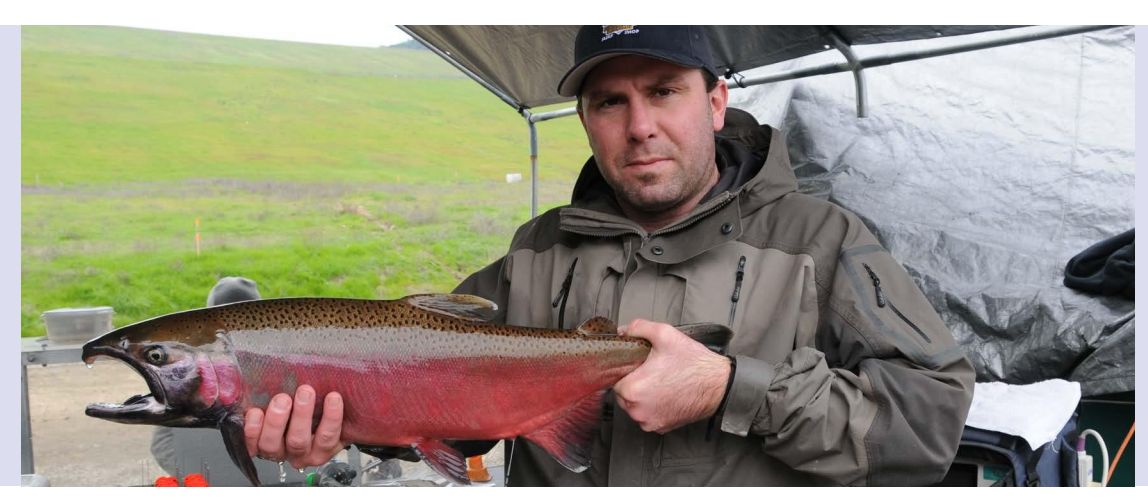
Coho Salmon