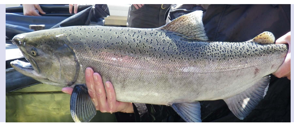
Sac Winter Run Chinook

fry mortality and low flows that led to increased predation on juveniles. The drought took a severe toll on winter-run Chinook salmon in 2014, and unfortunately 2015 will be another challenging year for the population given the low water storage levels as of March 2015 in Shasta Reservoir and limited snowpack.