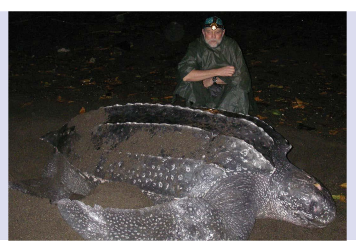
Large female leatherback turtle at a nesting beach in the Solomon Islands.

sea turtles. Some of the accomplishments under these agreements include the development of the InterAmerican Convention for the Protection and Conservation of Sea Turtles (IAC) East Pacific Leatherback Task Force, which is identifying ways that IAC Parties can implement the 2012 New Plan of Action for East Pacific Leatherbacks. The United States has also played a leadership role within Regional Fishery Management Organizations, proposing and/or supporting resolutions to protect sea turtles. In addition to these regional and multilateral agreements, NMFS and FWS have supported bilateral projects, either through grants or in-kind support to recover Pacific leatherbacks throughout their range. For instance, in Papua Barat, Indonesia, a significant nesting area for Western Pacific leatherbacks, NMFS and FWS have collaborated with local institutions for more than a decade to reduce poaching on nesting beaches, establish regular nesting surveys, improve community engagement in the protection of the nesting beaches, and ensure that protection continues into the future.